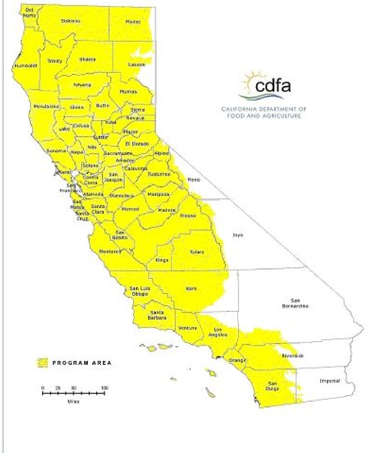
ENTRIX Light Brown Apple Moth Eradication Program Environmental and Natural Resources Management Consultants FIGURE ONE PROGRAM AREA LOCATION

Expanded LBAM Program Area as of July 2008